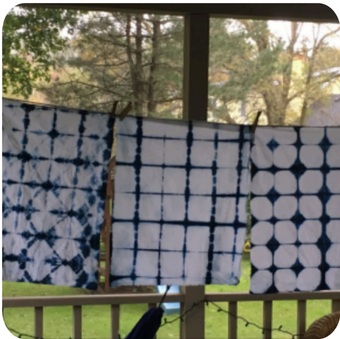
Shibori with Julie Olson

Shibori is a Japanese manual resist dyeing technique, which produces patterns on fabric. Create your own patterns using 12x12" cotton squares, perfect to serve as a placemat or runner.