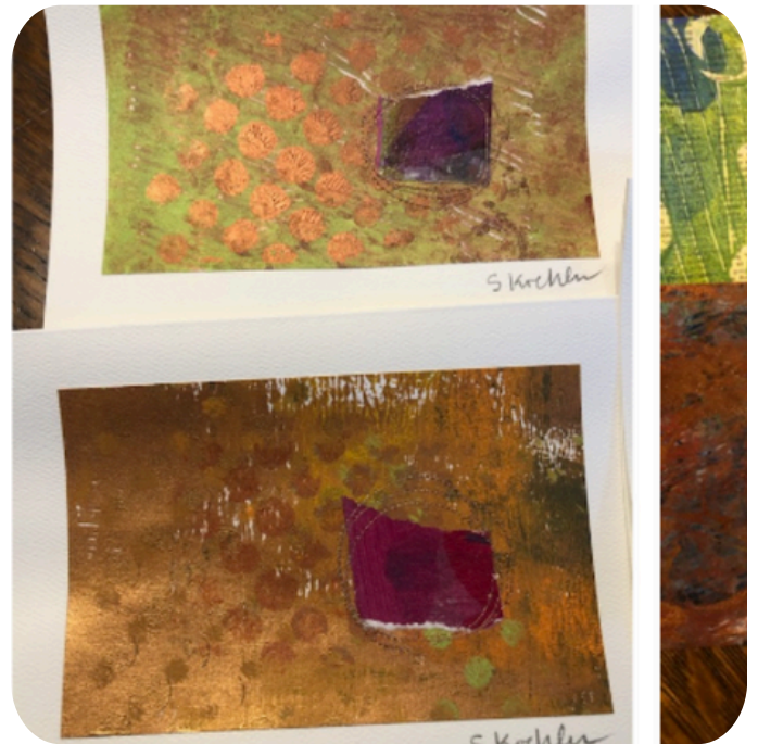
Mono Printmaking with Sally Koehler

Experiment making mono prints on Gelli plates using texture tools, stencils, drawing materials and more. Explore different colored paint and papers. It is magical to see how your prints emerge onto paper.